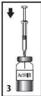
Figure 3 Insert the syringe needle through the stopper of the vial of lyophilized ActHIB vaccine component and inject the liquid into the vial.