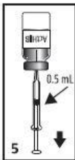
Figure 5 After reconstitution, immediately withdraw 0.5 mL of Pentacel vaccine and administer intramuscularly. Pentacel vaccine should be used immediately after reconstitution.

In infants younger than 1 year, the anterolateral aspect of the thigh provides the largest muscle and is the preferred site of injection. In older children, the deltoid muscle is usually large enough for injection. The vaccine should not be injected into the gluteal area or areas where there may be a major nerve trunk.